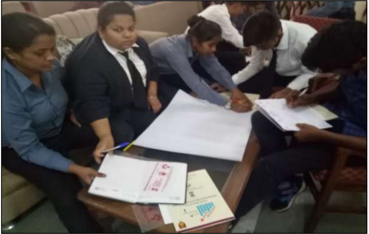
Participants doing 'B' Plan Activity