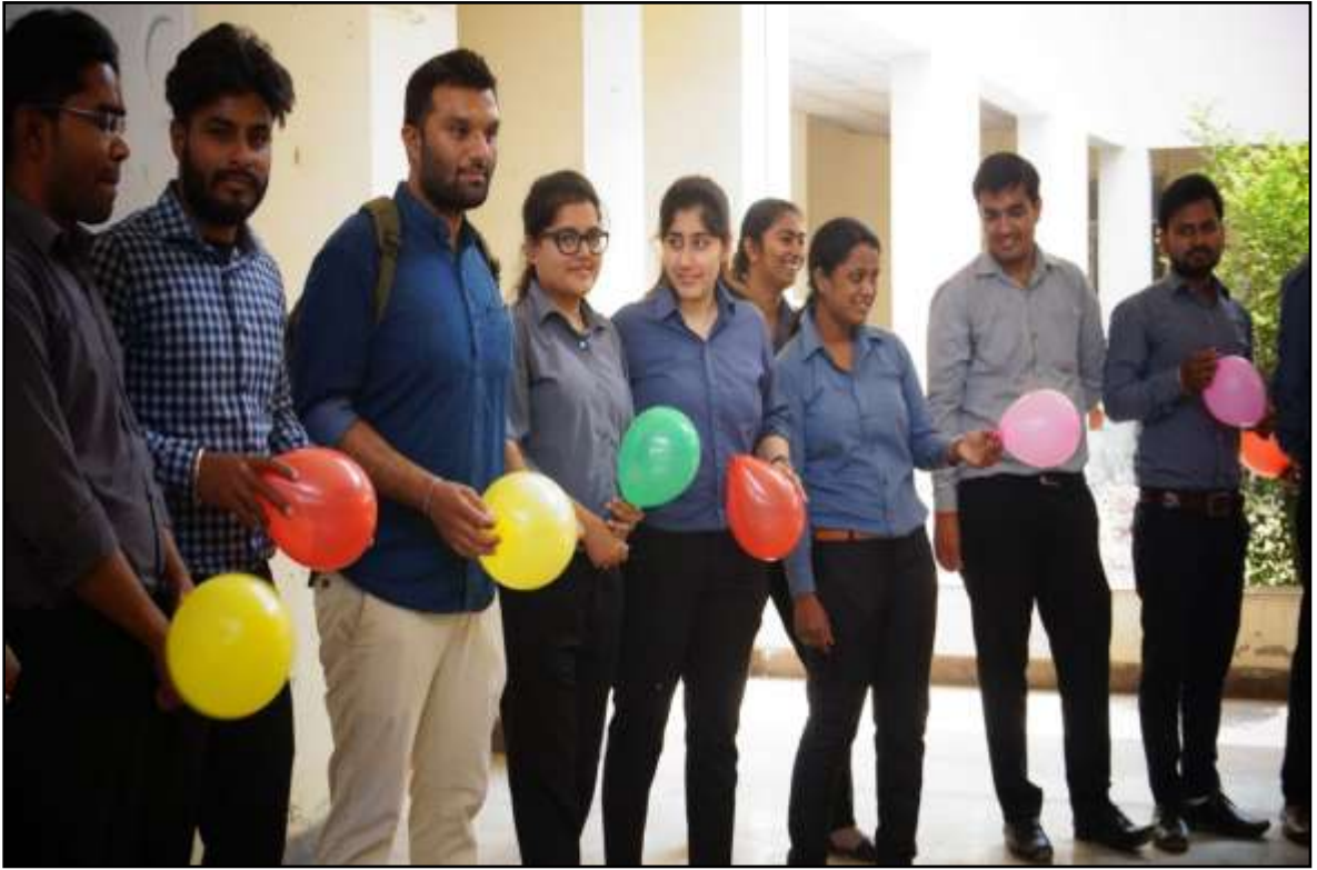
Participants doing activity