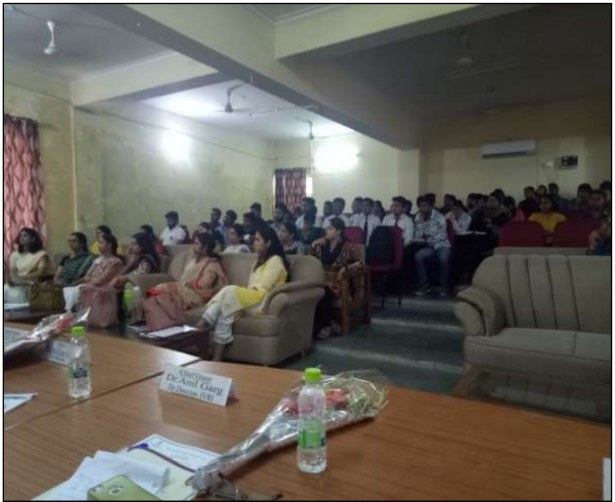
Classroom Session during EAC